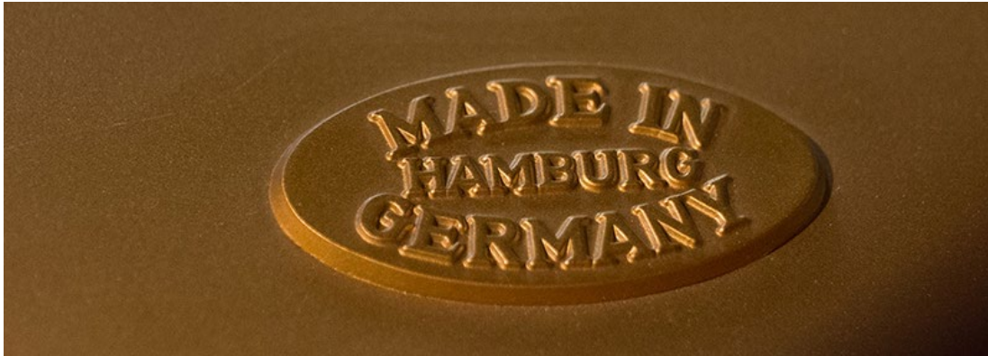
An important confirmation in the metalwork in this Model O-180

During much of the twentieth century, Steinway's mid-sized grand offering evolved, with the Model L serving as the principal alternative to the Model O.