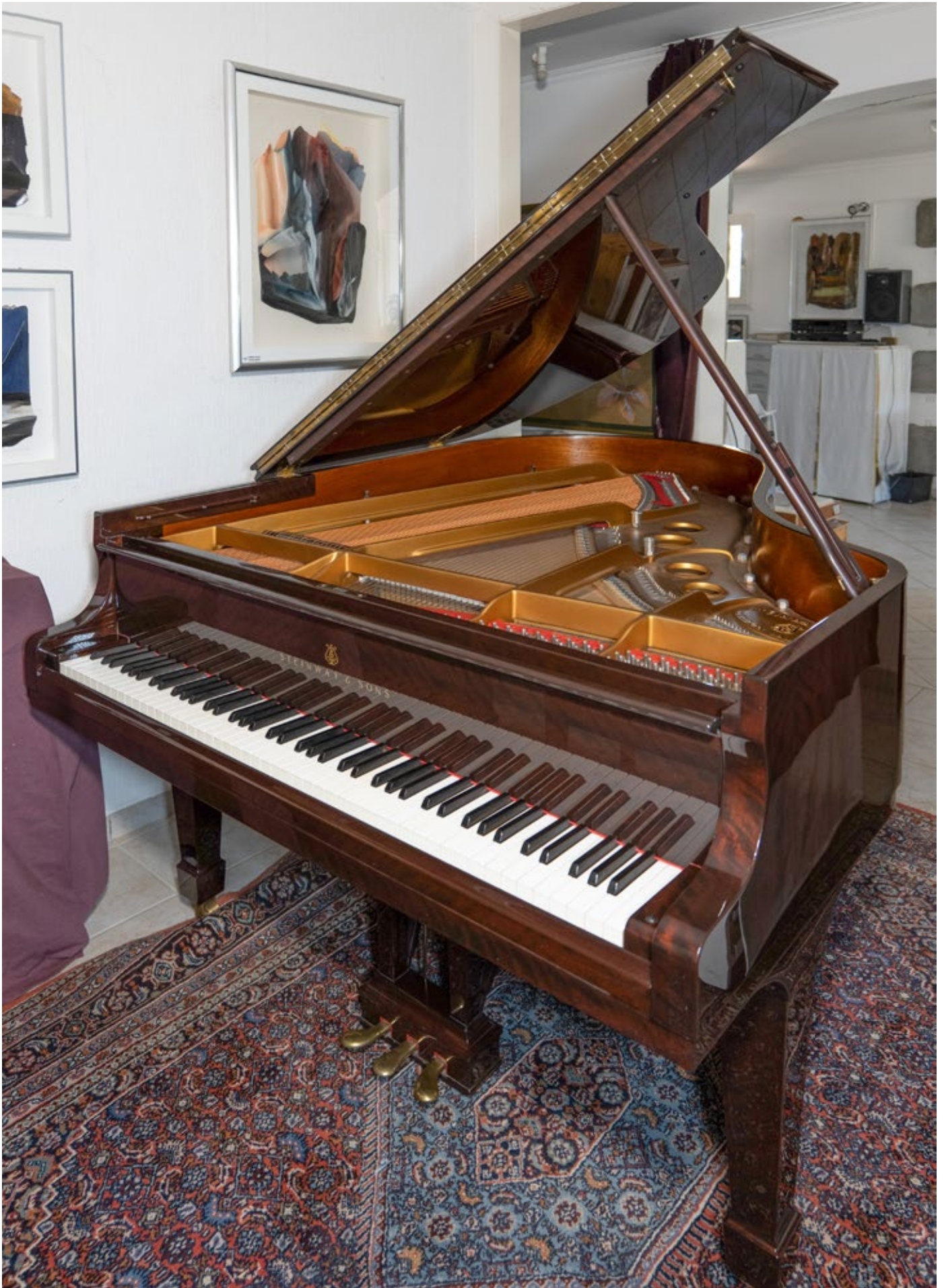
Steinway & Sons Model O-180 Hamburg-built grand piano, in exceptional condition, prepared for long-term private use